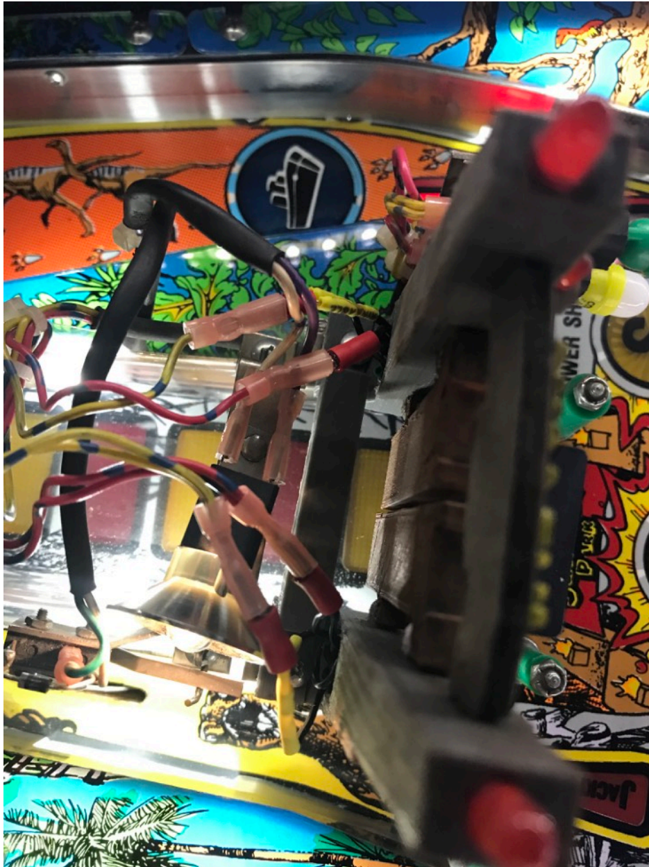
(Figure 2: Connections to the new Gate)